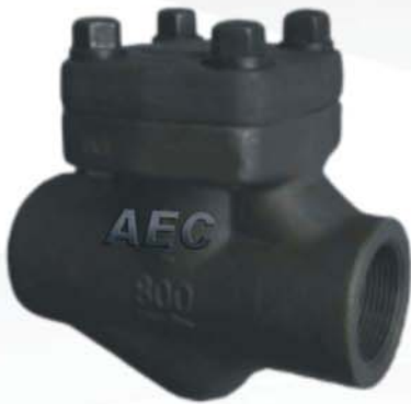
Screwed / SW End